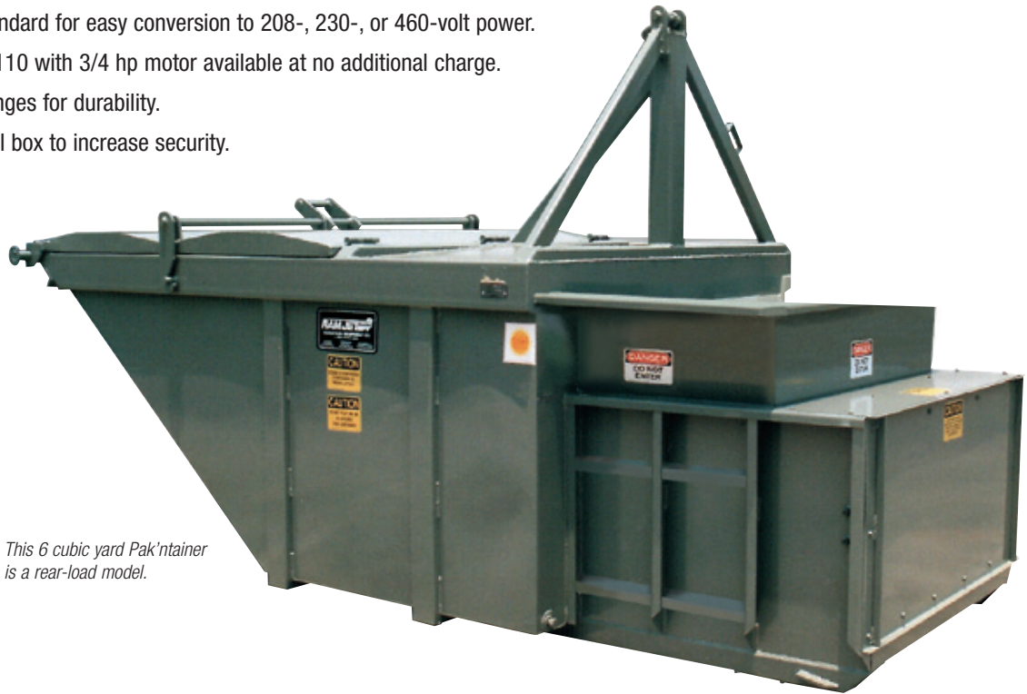
This 6 cubic yard Pak'ntainer is a rear-load model.