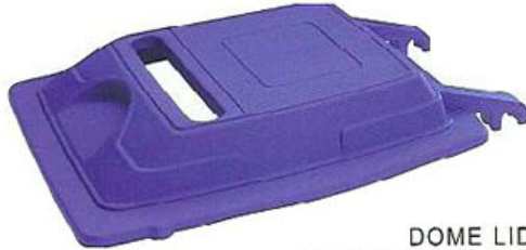
DOME LID WITH PAPER SLOT