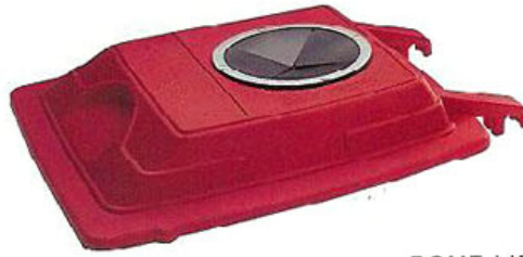
DOME LID WITH 9" GLASS COLLAR