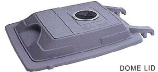
DOME LID WITH 5" CAN COLLAR