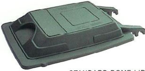
STANDARD DOME LID

A Variety Of Options For Caster Carts And Two-Wheel Carts