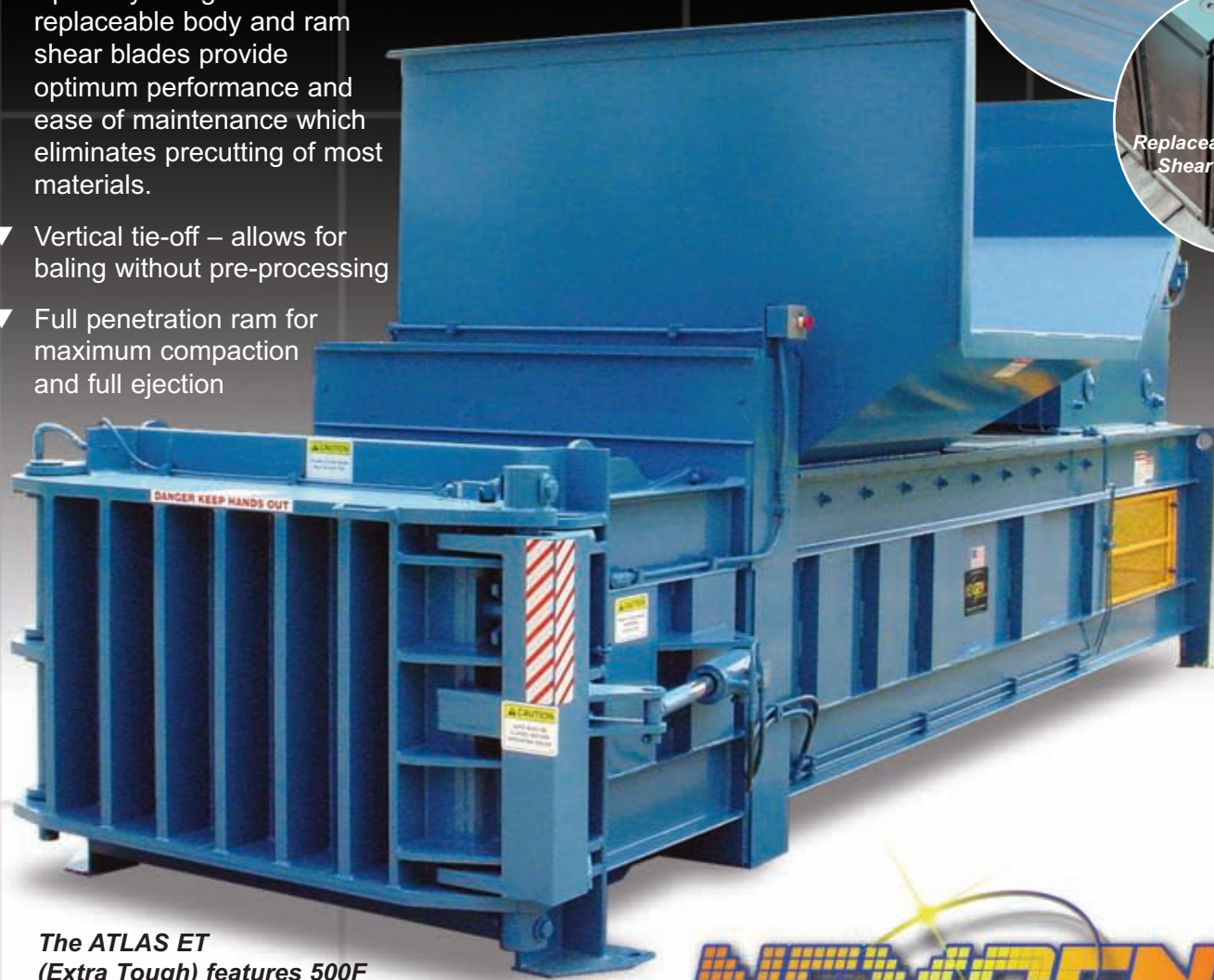
Replaceable Ram Shear Blade

The ATLAS ET (Extra Tough) features 500F liners and S-7 hardened steel ram and body shear blades for even tougher application requirements!