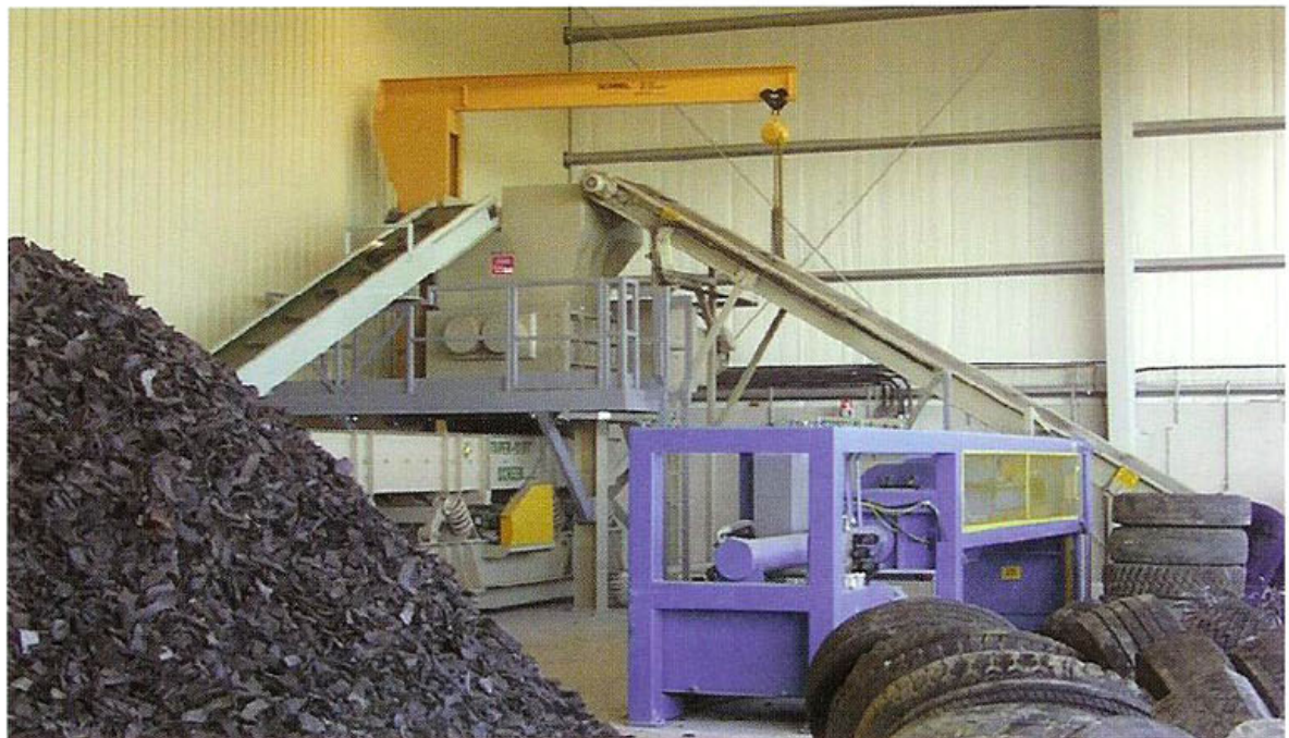
ST-200E Tire Shredding System for producing tire derived fuel