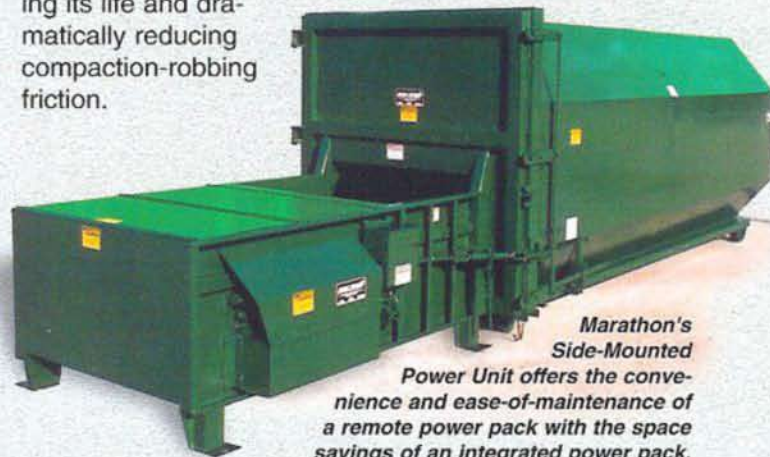
Marathon's Side-Mounted Power Unit offers the convenience and ease-of-maintenance of a remote power pack with the space savings of an integrated power pack.

The packing ram is supported and guided by specially formulated cast iron shoes which ride on replaceable wear strips. This exclusive design protects the charge box floor from the full force of the packing ram, extending its life and dramatically reducing compaction-robbing friction.